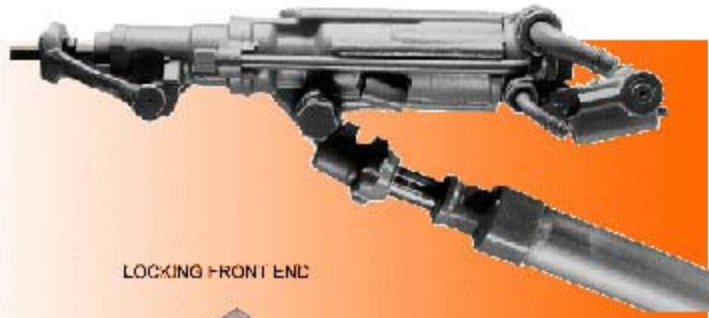
LOCKING FRONT END